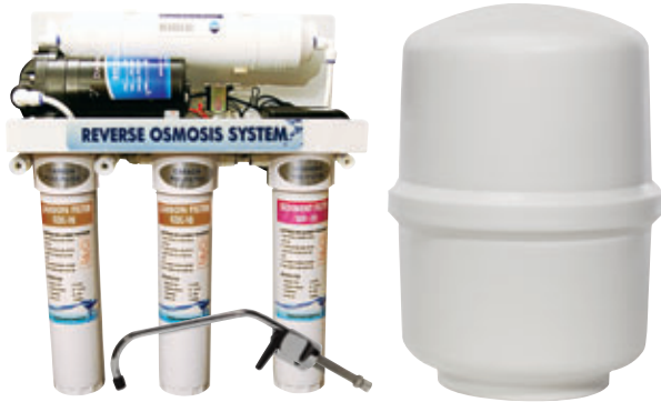
475 Pro Series With Booster Pump